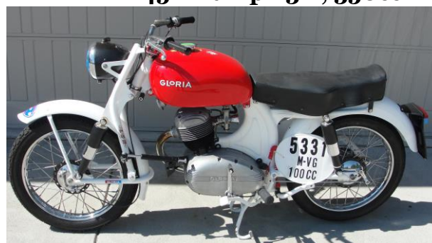
'54 Focesi Gloria, 100cc