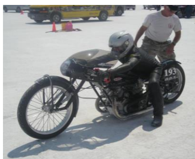
'67 Triumph, 650cc