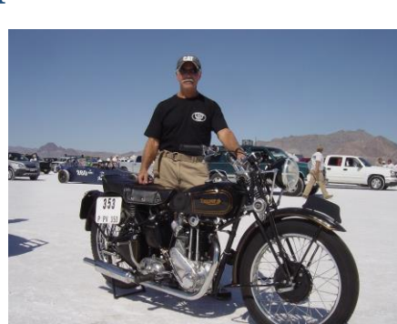
'45 Triumph 3H, 350cc