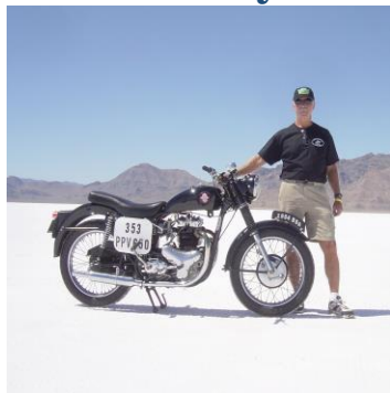
'54 BSA A-10, 650cc