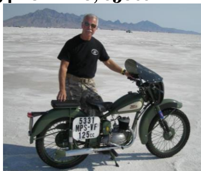
'51 BSA Bantam, 125cc