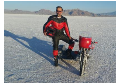
'75 Honda, Little Red, 100cc